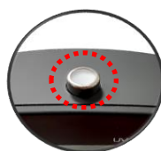
UV Detecting Sensor