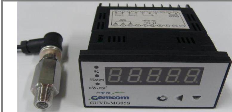
Fig. 1 UV Radiometer 5.0 (Size of Display : 97 × 50 × 112mm 3 )