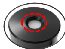
UV Detecting Sensor