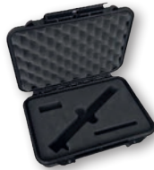
BOX Art. No. 3150001117

Black plastic material with preformed grooves to accept FIBERPOINT®, batteries, dust cap and one optional adapter (1.25 mm / SMA / POF)