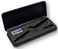
Etui Art. No. 3150000401

Black plastic material with preformed grooves to accept FIBERPOINT®, batteries, dust cap and one optional adapter (1.25 mm / SMA / POF)